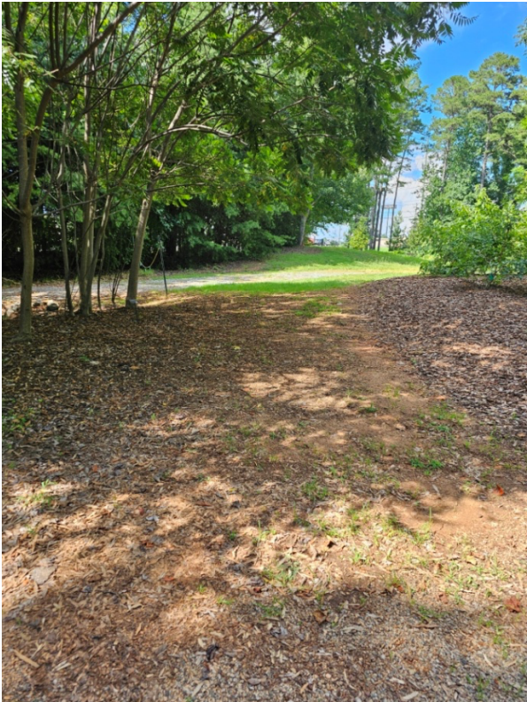
Gravel pathway connecting the current path to the upper part of the access road.