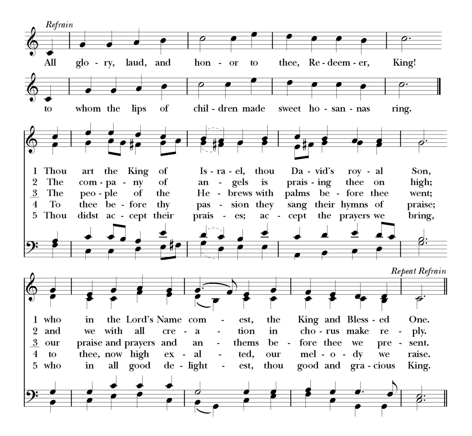
The Hymnal 1982 – 154 Valet will ich dir geben