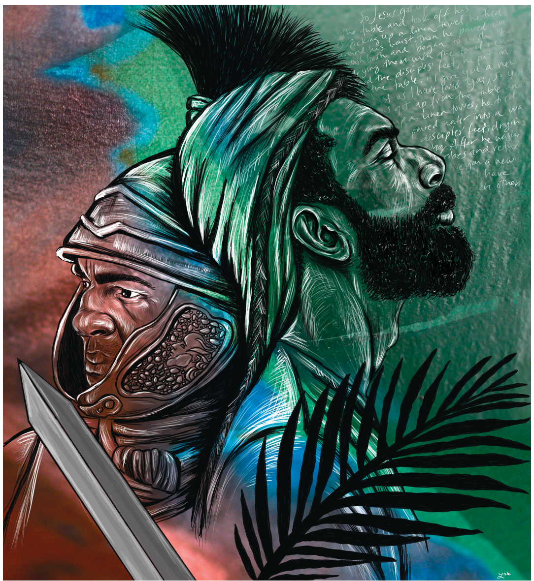
Lisle Gwynn Garrity © A Sanctified Art LLC | sanctifiedart.org